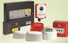
FIRE DETECTION & ALARM SYSTEM