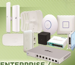
WiFi ENTERPRISE / NETWORKING / WIRELESS BROADBAND