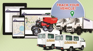
GPS VEHICLE TRACKING & FLEET MANAGEMENT SYSTEM